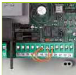
Real-time indication of the product operating status