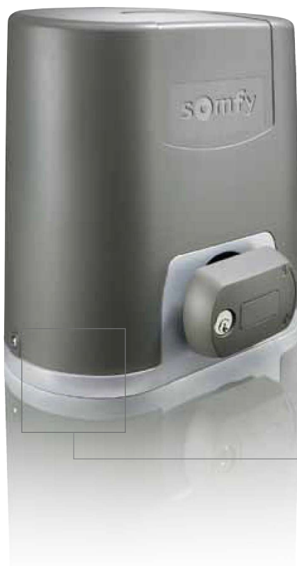
Motor ground fixation