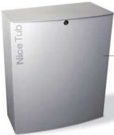
Ventilated motor to increase work cycle efficiency