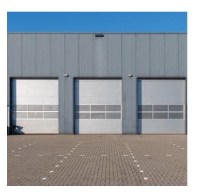
Healthcare Education Warehouse