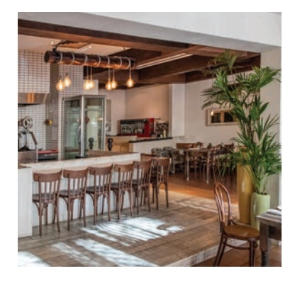
Small Business Restaurant/Café